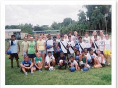
USA Merrill High School students and the 11/12-year-old soccer team from August Pine Ridge.