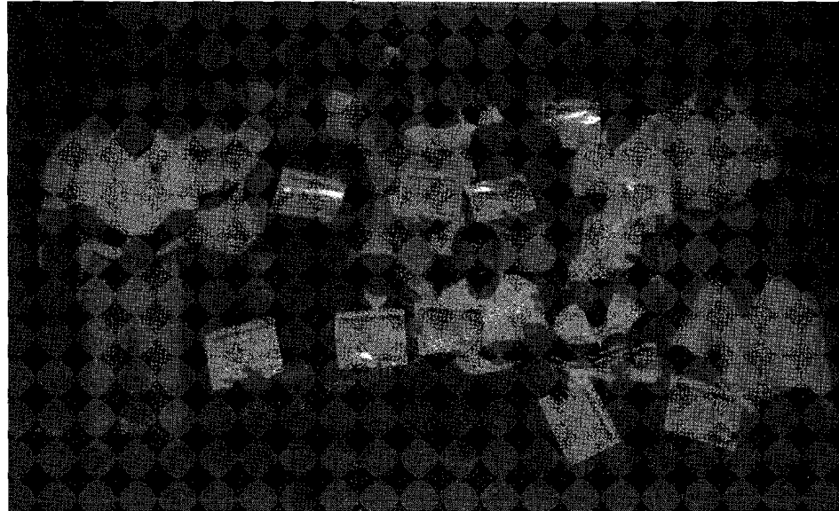
Eighteen persons graduate from Birder Course.